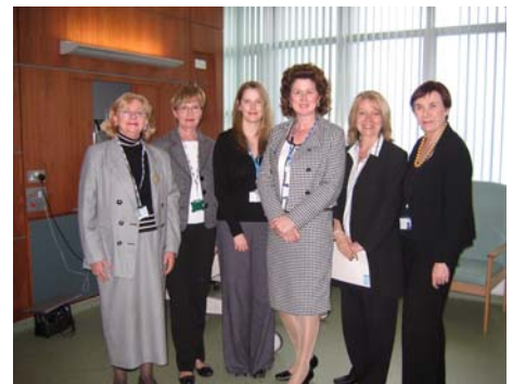
Scrutiny councillors and North West London Health Trust colleagues in one of the new maternity suites at Northwick Park Hospital

In March, a number of us visited Northwick Park Hospital to look around the facilities and speak with staff about care issues and the recent improvements at the hospital. We met with the Chief Executive and the Head of Midwifery and were shown around the newly refurbished maternity facilities, as well as the children's wards and Accident and Emergency department. Over the past year, the sub-committee has discussed at length the actions taken by North West London Hospitals Trust to address the Healthcare Commission's investigation into maternal deaths at Northwick Park Hospital. It was valuable to witness directly the improved practices at the hospital and hear first hand from those involved in providing care to patients. The sub-committee is assured that lessons have been learnt and clinical care is improving as a consequence.