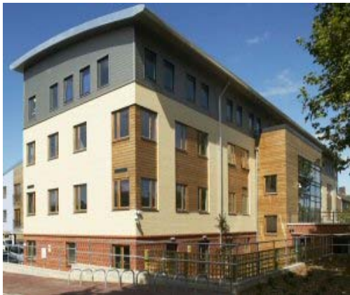
The new Health and Social Care Centre in Alexandra Avenue, Rayners Lane

This year in seeking to improve how scrutiny is conducted in Harrow, scrutiny has piloted a number of new methodologies in its review work. Two of these have been applied to health and social care matters. Reflecting the picture around much of London, and indeed nationally, NHS partners find themselves encountering challenging financial times. A standing review to consider local NHS financial positions has been set up and this is detailed in more depth under the Overview and Scrutiny Committee's section of this annual report. In November, the Adult Health and Social Care Sub-Committee conducted a challenge panel to examine issues relating to homecare and this is detailed below in the case study.